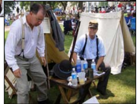
^ Civil War re-enactors on the grounds demonstrate camp life for visitors.