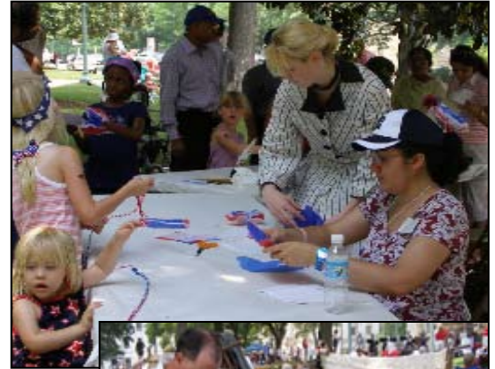
> Capitol staff show kids how to make tissue paper rosettes